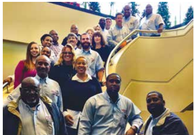
The Concourse management staff wishes you the very best for the New Year.