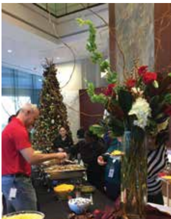
The lobbies at Concourse echoed with the sweet sound of harp music.

Thank you for joining us for the holiday breakfasts on December 6 and 7. We hope you all enjoyed the scrumptious food and holiday music.