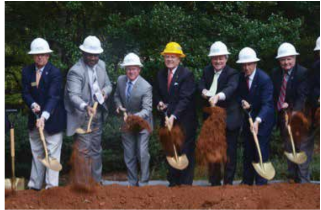
Ceremonial ground breaking for the proposed reconstruction of the I-285 and GA-400 interchange.

On November 3, 2016, Governor Nathan Deal, GDOT, and other state and local officials broke ground on the reconstruction of the I-285 and GA-400 interchange in front of Concourse Six. The work will improve the design as well as add capacity to the interchanges, while adding miles of new collector/distributor lanes to both I-285 and GA-400. Work should be underway by February 2017. In addition, the PATH Foundation and City of Sandy Springs are contributing to extend PATH 400 trail further north from Buckhead and through the new interchange. Having such a multi-use trail, connecting multiple area cities and running through a major interchange, will also eliminate the typical physical division of many communities caused by the presence of an interstate roadway.